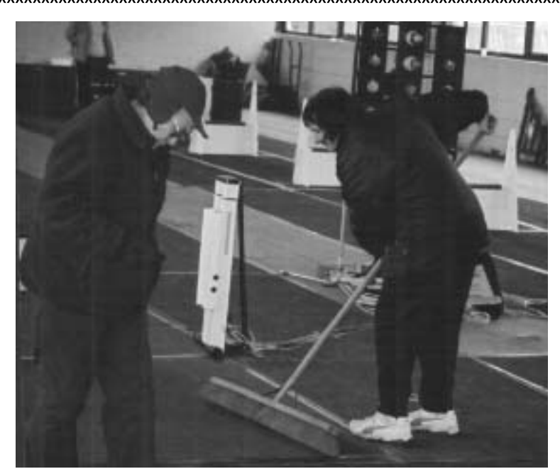
Our new Treasurer tries to balance the books by checking the sweeping up for any loose change!!!